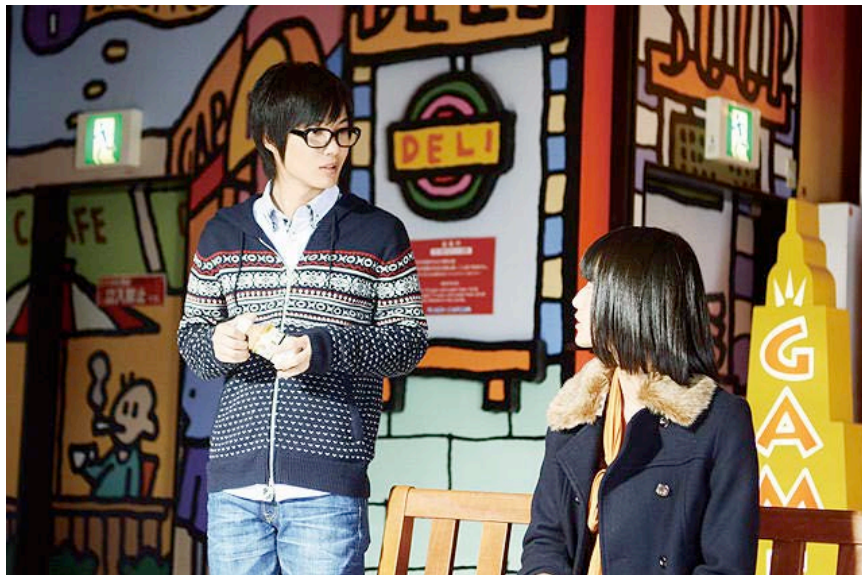
Figure 2: The encounter between Kasumi and Maeda at the cinema

Maeda and Kasumi are alone for the movie and meet one another. They have a chance to chat, yet they feel shy and awkward. At school, they are classmates, but rarely have a chance to chat. Maeda does his best to break the ice by turning the conversation to film, which is what he likes. On the other hand, Kasumi talks about the past in which they have known each other since junior high school days. Maeda is glad that Kasumi still remembers him, which makes she laughs saying “Why not?” After the conversation, they go on their way.