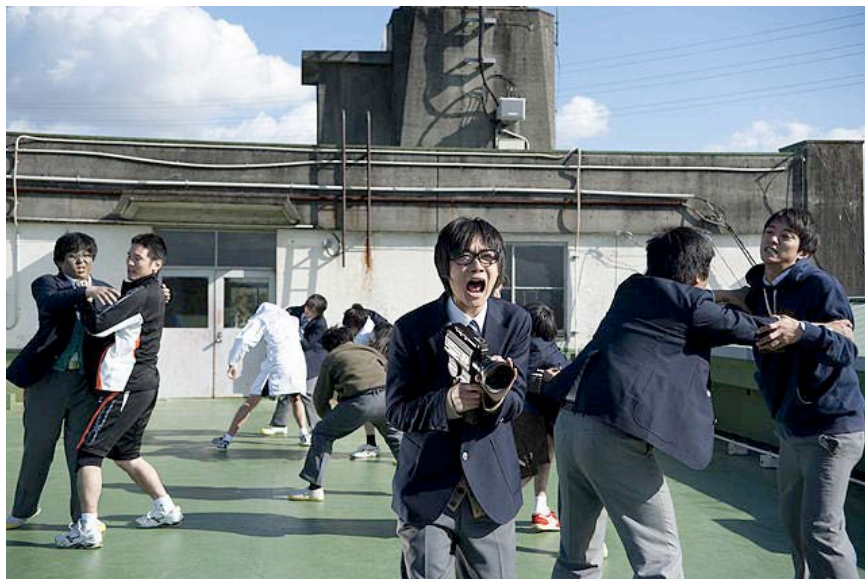
Figure 3: Event on the rooftop while shooting a movie

The unseen space of relationship between the two has narrowed down from perfect strangers to be old friends. The space for their meeting is changed from the school to the cinema. This means that the influence of a place impacts not only the way characters interact, but also space of relationship known as physical space as well as psychological space. This also makes a difference for the way characters behave and act (Paninya Paksa, p. 106).