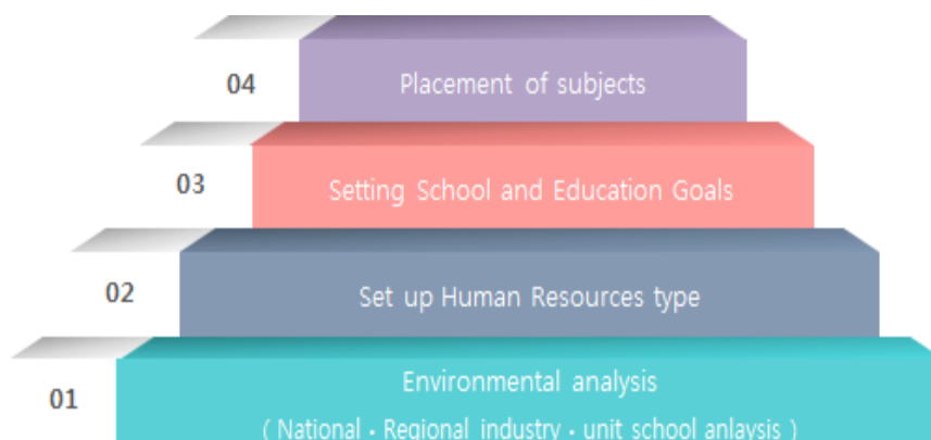
Figure 2: Vocational Education Training Curriculum Development Phase

In order to reform the NCS-based qualifications system, it is necessary to define the qualification criteria for performing the tasks in a specific field based on the NCS.