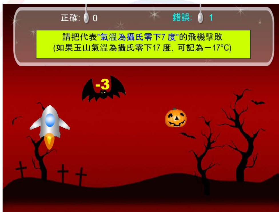
Fig. 1. The shooting games let the participants try to avoid the enemy's attack and try to return fire the correct answer at the same time.

The participants of this study were grade 5 to 6 elementary school students. A total of twenty-one students voluntarily participated in the study. One group was assigned to play the game of low cognitive load and the others were assigned to play the game of high cognitive load. The low cognitive load group, including ten students, was guided by the educational computer game that teaching materials with geography, while the high cognitive load group with eleven students was guided by the educational computer game that teaching materials with mathematics. All participants passed the eye-tracking calibrations. Students whose visual attentions were recorded by the eye tracking system while playing the educational computer games.