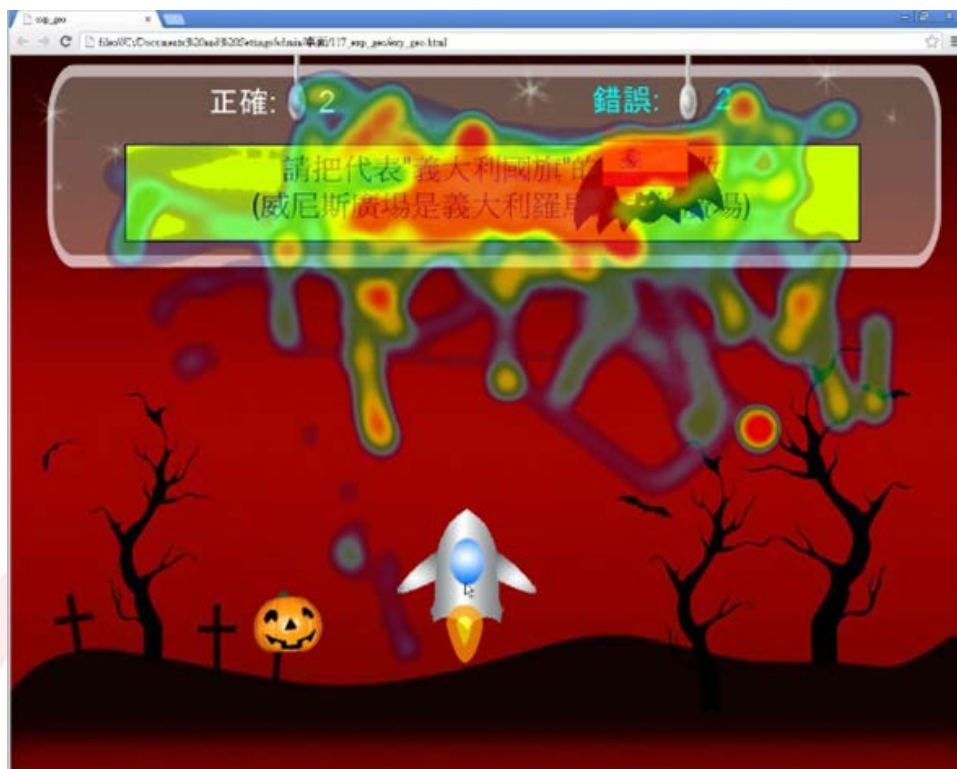
Fig. 3. Comparison of eye movement patterns on the ‘Region of Interest’ between learning materials and play zone. As the graphics show, the fixation densities of the students were higher on ‘Region of Interest’ learning materials.