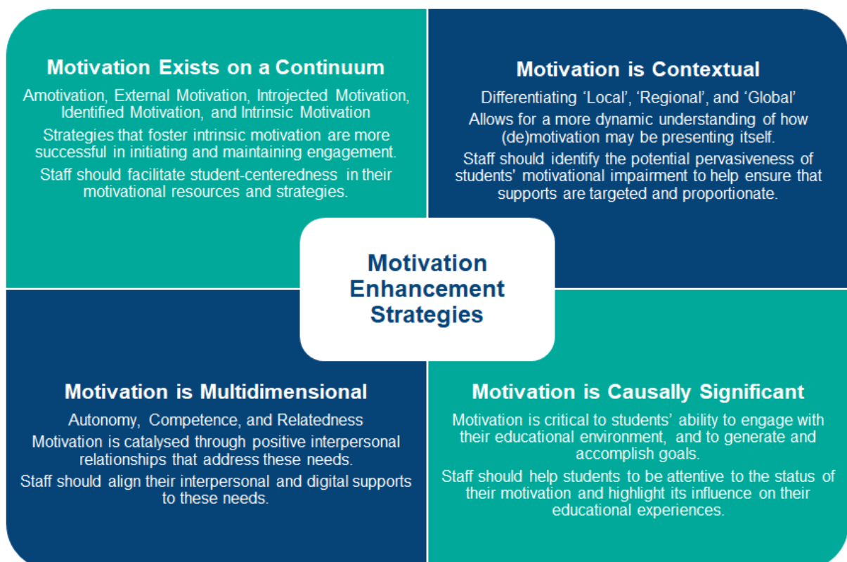
Figure 2. Motivation Engagement Matrix

Fourthly, motivation is causally significant. It is vitally important in terms of students' ability to generate and accomplish goals and successfully engage with personal and academic tasks. For example, amotivation has been associated with feelings of incompetence and helplessness (Vallerand et al., 1992), which can precipitate disengagement. It is, therefore, crucial to help students be attentive to the status of their motivation, highlighting the role that it can play in influencing the trajectory of their educational experiences.