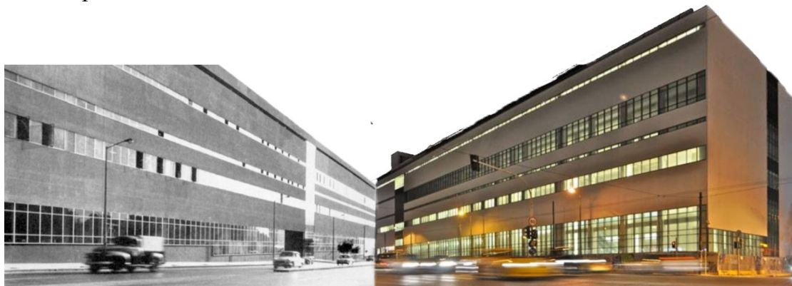
Figure 1 The FIX Building as a factory (left) and as a Museum (right)

The new industrial building was completed in 1961. The design, by the architect Takis Zenetos and his colleague Margaritis Apostolidis, in their attempt to create a flexible, capable of changing and adapting to future industrial uses form, embraced the principles of the modern movement in architecture: a dynamic shape with austere linearity in order to give a sensation of the building extending to infinity, long openings to further stress the longitudinal axis and recreate a connection with its environment, open plans, use of clear-cut materials, etc.. Very soon, the new industrial building was destined to be a historic landmark of modern architecture and the city. Unfortunately, ten years later, FIX Brewery production was transferred away from the city center and the building was abandoned. Around 1994, the northern part of the building was demolished to make room for the subway construction works. This act was sharply criticized by architects, urban planner, heritage preservatives and scholars (N. Theodoropoulou, 2018). In 2000, preceded by a number of consultations and considerations the old FIX Brewery was decided to be adaptively be reused as the new house of the Hellenic National Museum of Contemporary Art (EMST) ( www.emst.gr/en ). The project was assigned to 3SK Stylianidis Architects and K. Kontozoglou, I. Mouzakis & Associate Architects and Tim Ronalds Architects, and was completed late 2014.